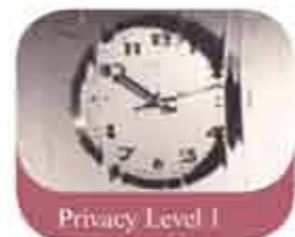
Privacy Level 1