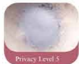
Privacy Level 5