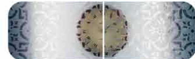
Pilkington Oriel Texture Canterbury™

Due to the manufacturing process, the pattern of Warwick™ is completely random and no two pieces are the same.