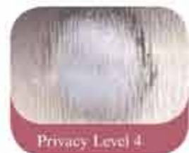
Privacy Level 4