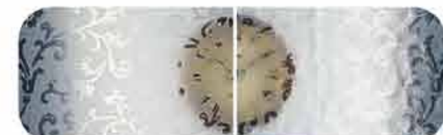
Pilkington Oriel Texture Brocade™