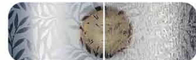
Pilkington Oriel Texture Laurel™