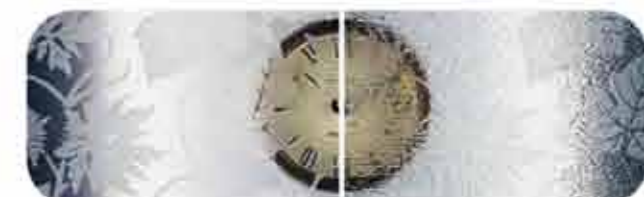
Pilkington Oriel Texture Coppice™

With a superb range of designs, together with diffused glass options for each design, this premium range of etched glass adds a touch of style and elegance to your home.