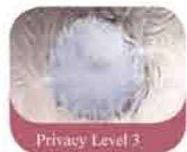
Privacy Level 3