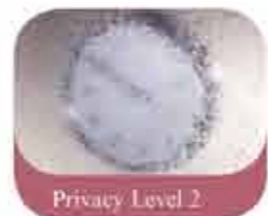
Privacy Level 2